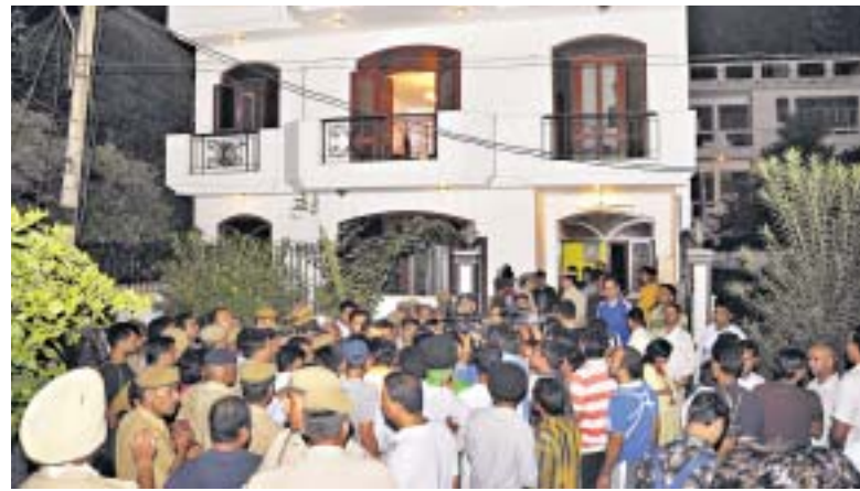
Crowd gathers after the police encounter at Palam Vihar in Gurgaon